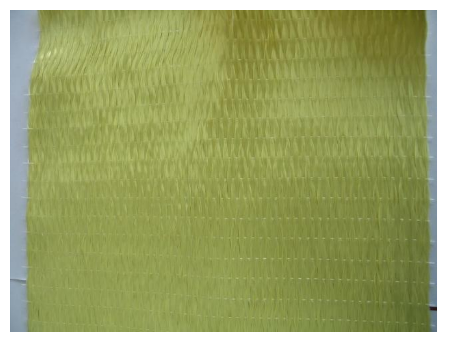
Fig. 3. Aramid fibre

Aramid fibres are a class of heat-resistant and strong synthetic fibres. They are used in aerospace and military applications and as an asbestos substitute.